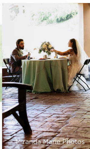
Miranda Marie Photos